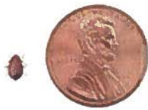
*Adult bed bug-actual size.

Bed bugs are small, flat, wingless insects. They feed on blood and can be a nuisance for individuals. They are named for their tendency to live on mattresses or other parts of a bed.